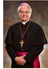
Third Bishop of Las Vegas Roman Catholic Diocese of Las Vegas