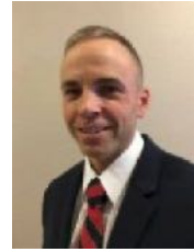
State Warden & Program Director